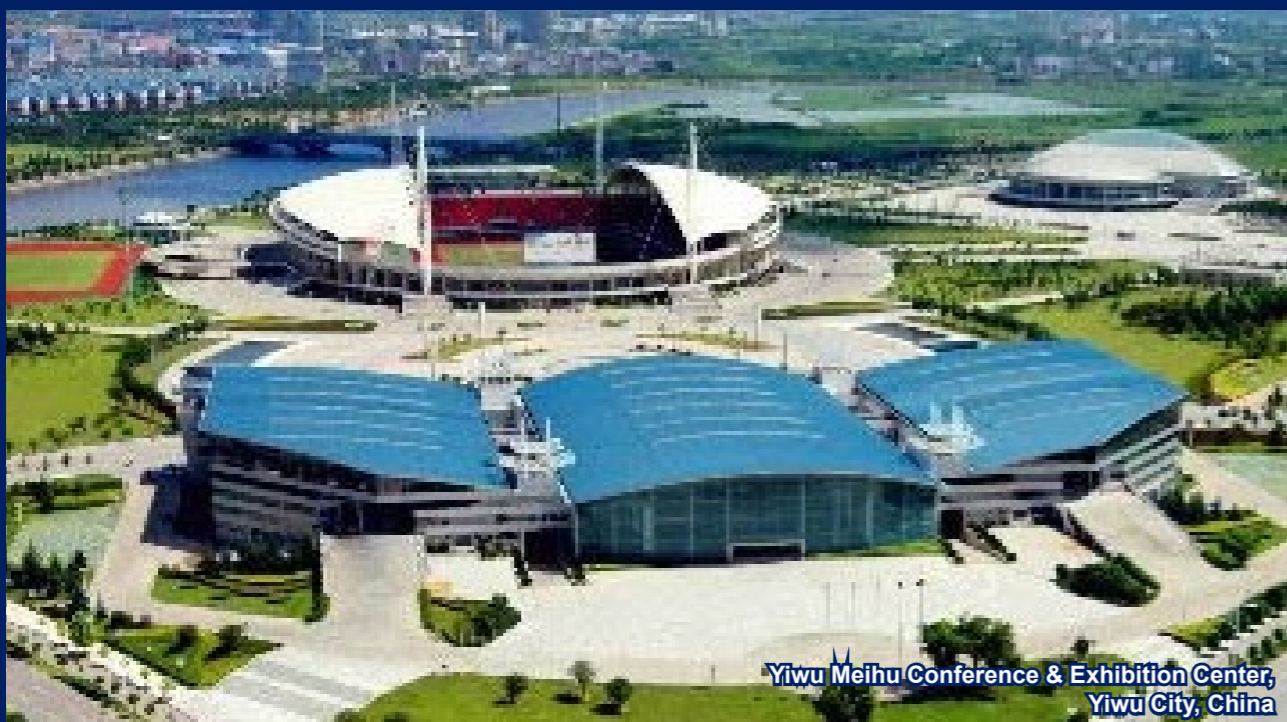
Yiwu Meihu Conference & Exhibition Center, Yiwu City, China